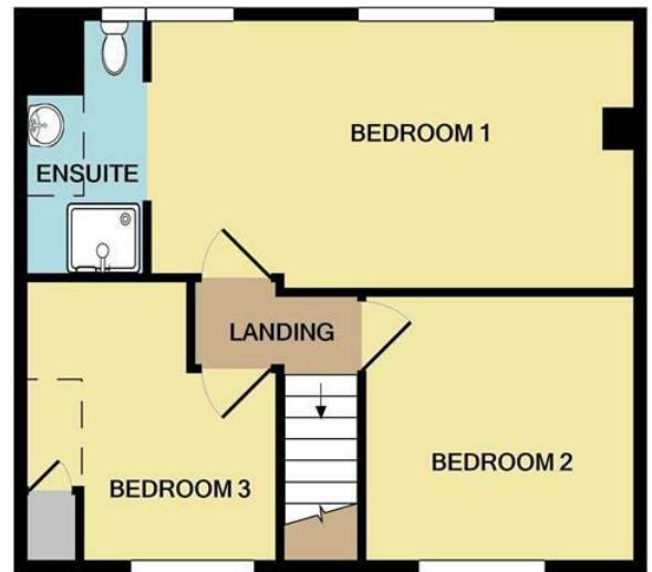
1ST FLOOR APPROX. FLOOR AREA 438 SQ.FT. (40.7 SQ.M.)

TOTAL APPROX. FLOOR AREA 1262 SQ.FT. (117.3 SQ.M.)